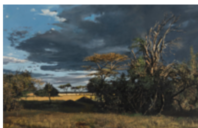
Richard Estes Serengeti, 2015 Oil on panel 34.9 x 55.6 cm / 13 3/4 x 21 7/8 in