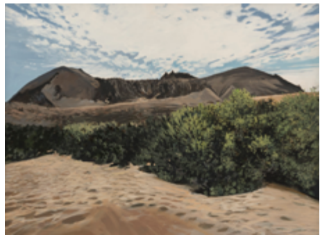
Richard Estes Galapagos, 2010 Oil on panel 30.5 x 41.3 cm / 12 x 16 1/4 in