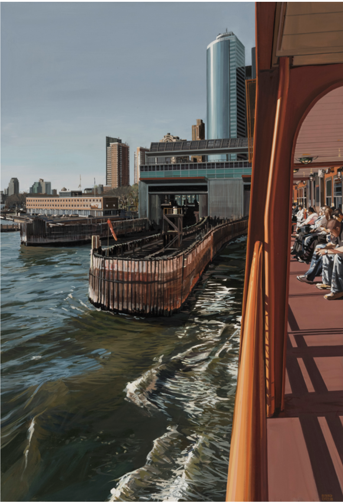
Richard Estes, Staten Island Ferry Docking Manhattan , 2008