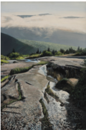
Richard Estes Beech Hill I, 2010 Oil on panel 57.8 x 39.4 cm / 22 3/4 x 15 1/2 in