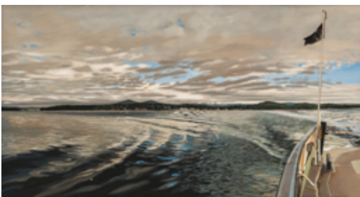
Richard Estes Approaching Storm, Lake Champlain, 1997 Oil on canvas 40.6 x 80 cm / 16 x 31 1/2 in