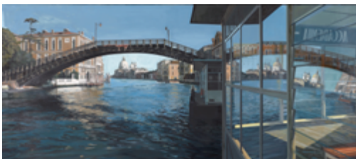
Richard Estes The Italian Accademie, Venice, 1980 Oil on canvas 60.3 x 137.2 cm / 23 3/4 x 54 1/8 in Credit: Roz Akin