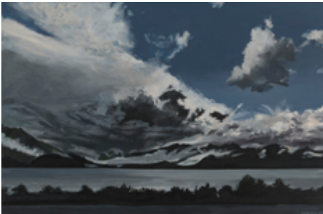
Richard Estes New Zealand II, 2017 Signed and dated at lower right: RICHARD ESTES / 2017 Oil on panel 47.6 x 72.7 cm / 18 3/4 x 28 5/8 in