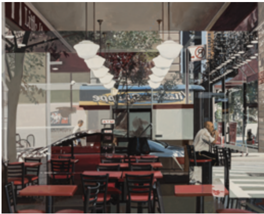
Richard Estes ATM , 2018 Oil on panel 40.6 x 50.8 cm / 16 x 20 in