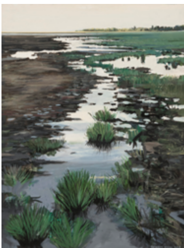
Richard Estes Ngorongoro Crater I, 2015 Oil on panel 34.9 x 30.2 cm / 13 3/4 x 11 7/8 in