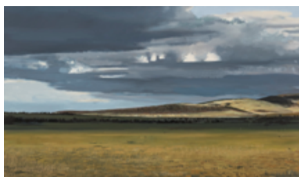
Richard Estes Ngorongoro Crater II, 2015 Oil on panel 30.5 x 55.9 cm / 12 x 22 in