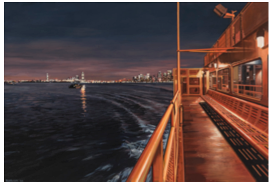
Richard Estes Staten Island Ferry Arriving with a Distant View of Manhattan and New Jersey , 2011 Oil on panel 32.7 x 47.9 cm / 12 7/8 x 18 7/8 in