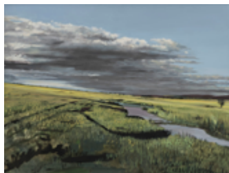
Richard Estes Ngorongoro Crater III, 2015 Oil on panel 45.7 x 61 cm / 18 x 24 in