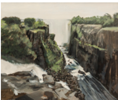
Richard Estes Victoria Falls II, 2015 Oil on panel 40.6 x 50.8 cm / 16 x 20 in