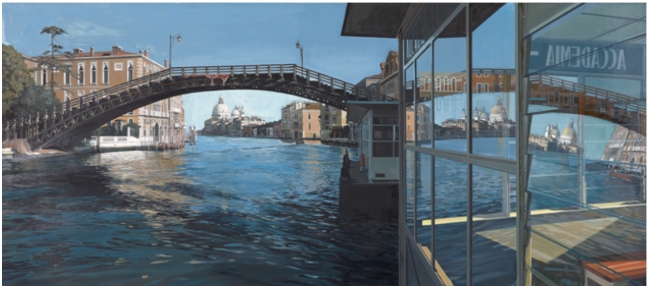
Richard Estes, Accademia, Venice , 1980