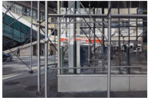
Richard Estes Century , 2020 Oil on canvas 76.2 x 114.3 cm / 30 x 45 in