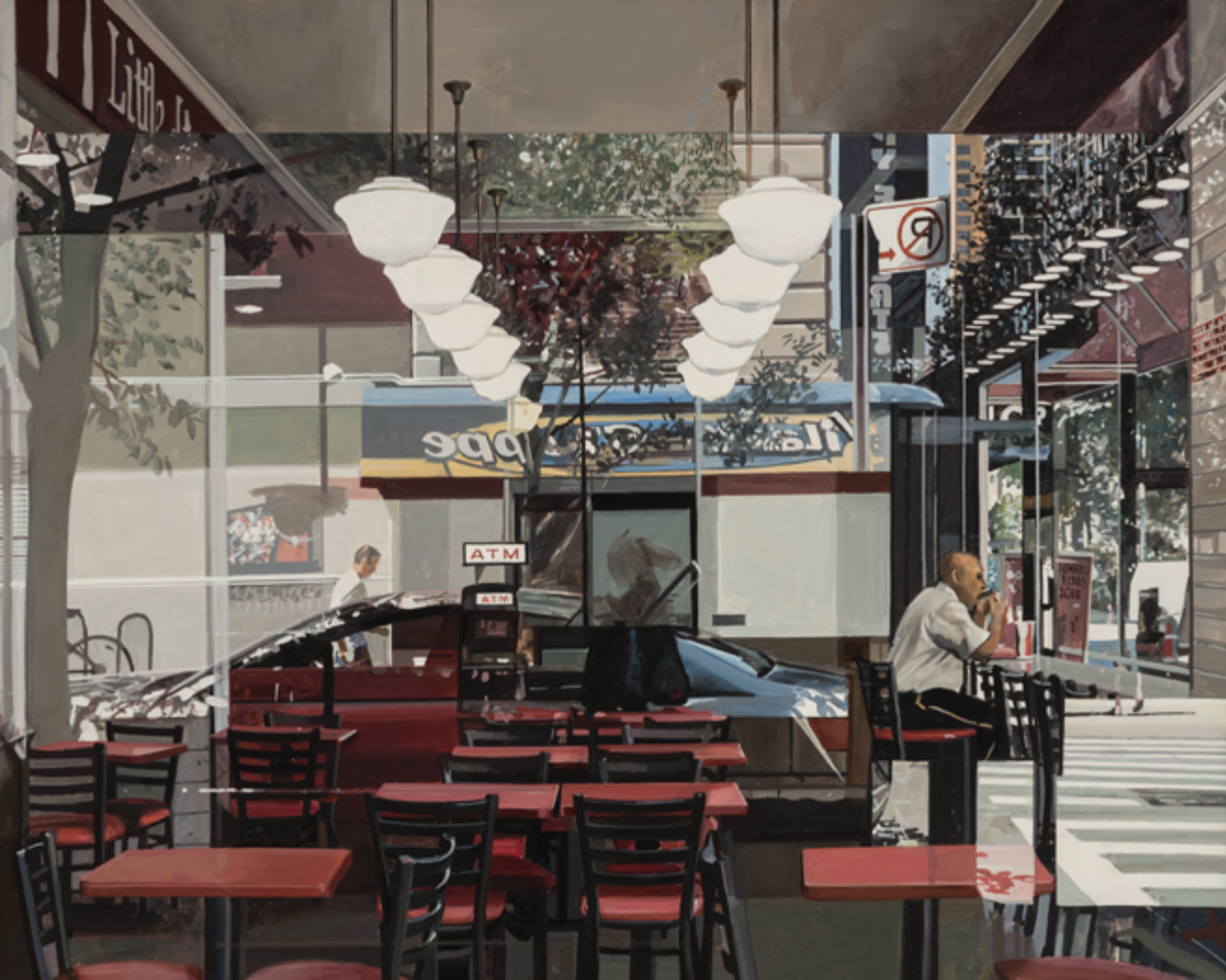
Richard Estes, ATM , 2018