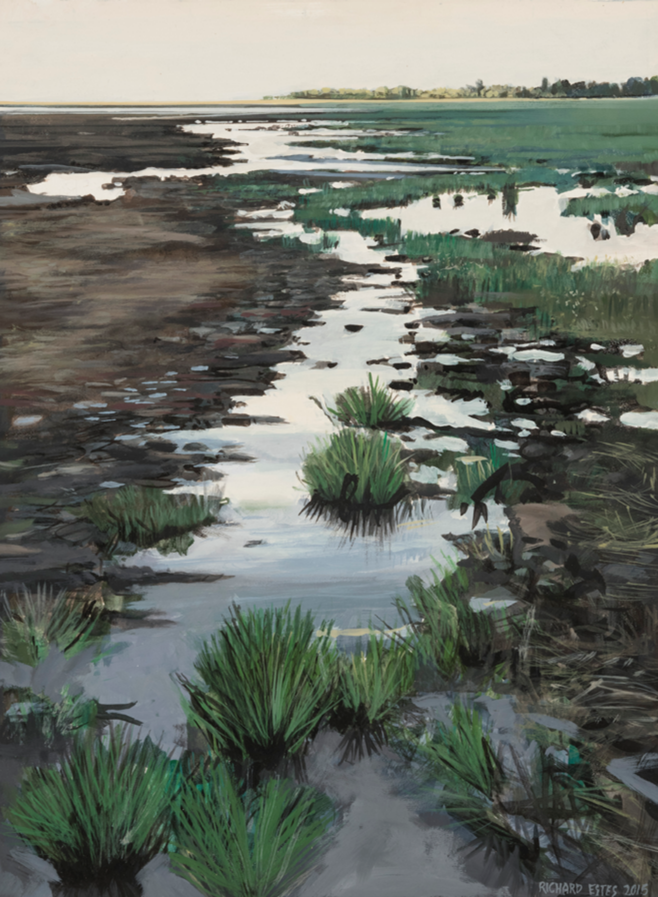
Richard Estes, Ngorongoro Crater I , 2015