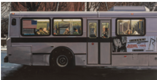
Richard Estes Rihanna, 2012 Oil on panel 30.5 x 61 cm / 12 x 24 in