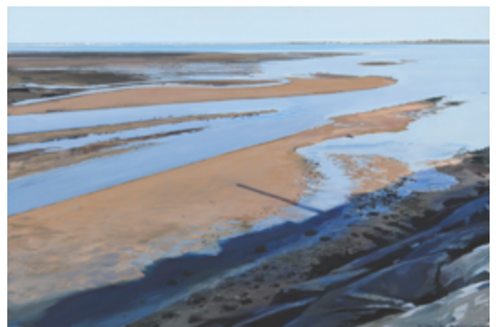
Richard Estes Late Afternoon Tide, Provincetown II , 2006 Oil on panel 34.3 x 51.1 cm / 13 1/2 x 20 1/8 in