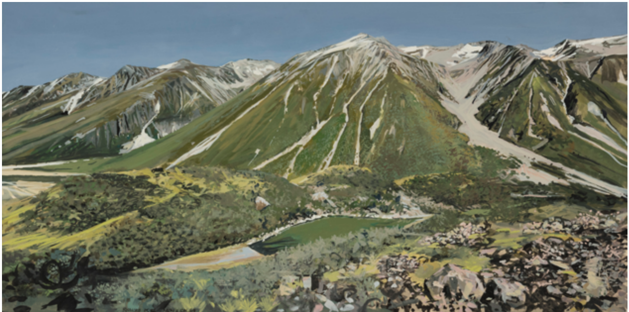
Richard Estes, Hidden Lake Near Mount Cook, New Zealand , 2010