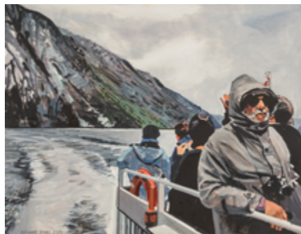
Richard Estes Norway, 2019 Oil on panel 27.9 x 35.6 cm / 11 x 14 in