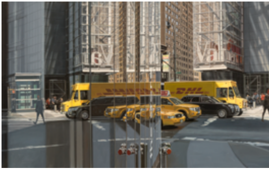
Richard Estes Express , 2020 Oil on canvas 94 x 139.7 cm / 37 x 55 in