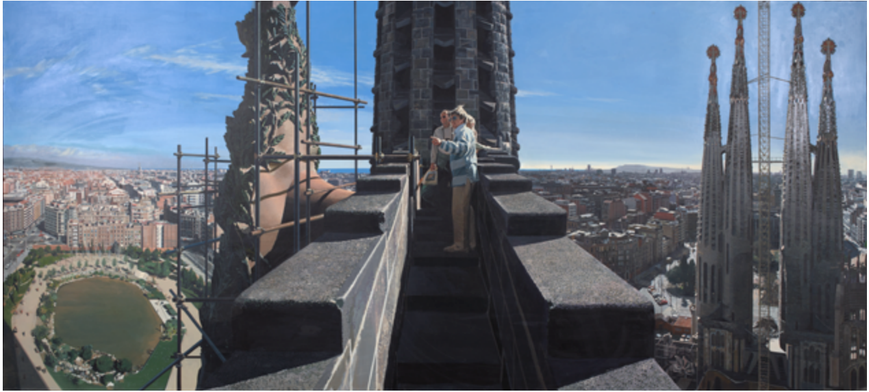
Richard Estes, View of Barcelona, Spain , 1987