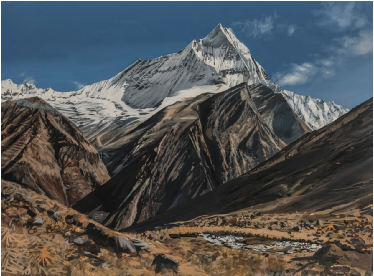
Richard Estes, View in Nepal , 2010