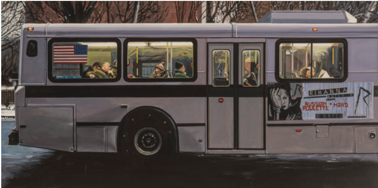
Richard Estes, Rihanna , 2012