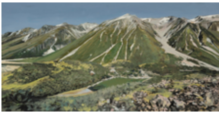
Richard Estes Hidden Lake Near Mount Cook, New Zealand, 2010 Oil on panel 27.9 x 55.9 cm / 11 x 22 1/8 in