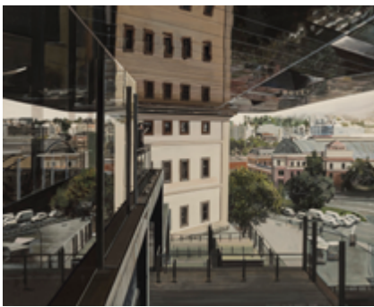
Richard Estes Madrid, 2018 Oil on panel 40.6 x 50.8 cm / 16 x 20 in