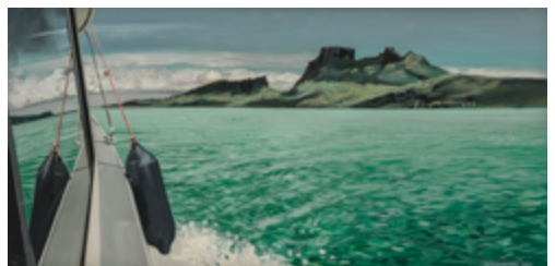
Richard Estes Tahiti, 2010 Oil on panel 22.9 x 47 cm / 9 x 18 1/2 in Credit: Josh Nefsky