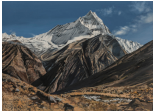
Richard Estes View in Nepal, 2010 Oil on canvas 81.3 x 109.2 cm / 32 x 43 in