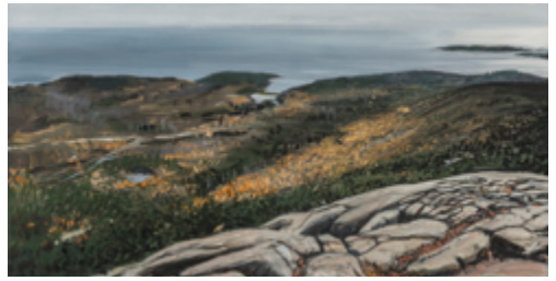
Richard Estes View from Cadillac Mountain, 2020 Oil on panel 40.6 x 55.9 cm / 16 x 22 in