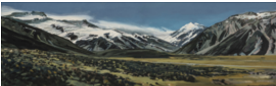
Richard Estes Mount Cook (New Zealand), 2010 Oil on panel 14.6 x 47 cm / 5 3/4 x 18 1/2 in