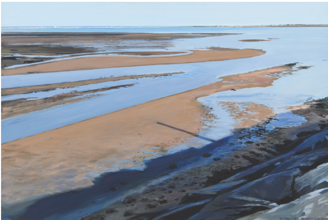
Richard Estes, Late Afternoon Tide, Provincetown II , 2006