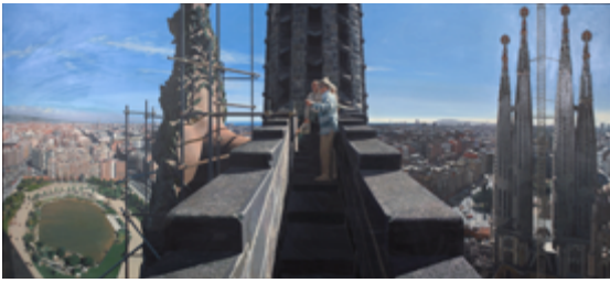
Richard Estes View of Barcelona, Spain, 1987 Oil on canvas 101.6 x 224.8 cm / 40 x 88 1/2 in Credit: Roz Akin