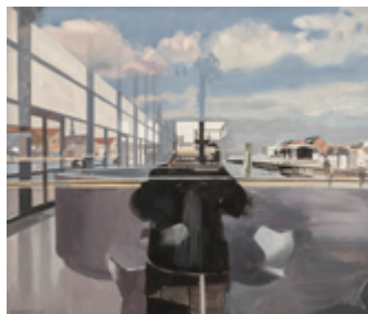
Richard Estes Self Portrait in Copenhagen, 2019 Oil on panel 40.6 x 50.8 cm / 16 x 20 in