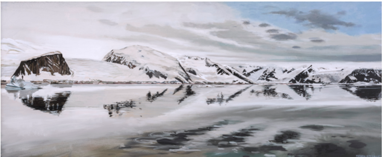
Richard Estes, Fog Lifting off the Coast of Antarctica , 2007