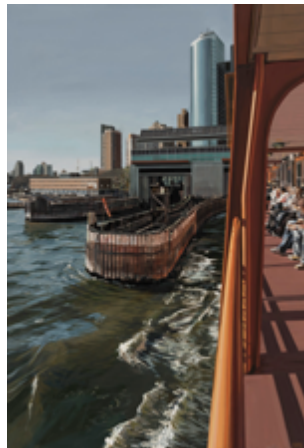
Richard Estes Staten Island Ferry Docking Manhattan, 2008 Oil on board 58.7 x 40.6 cm / 23 1/8 x 16 in